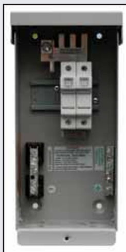
Configured with 2 600 VDC fuses