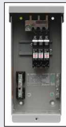
Configured with 3 150 VDC breakers