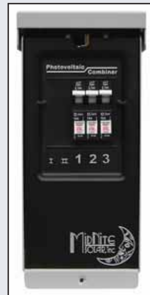
Configured for 150VDC Breakers (Offgrid)