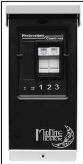
Configured for 600VDC Fuses (Gridtie)