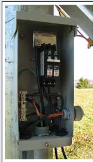
Installation photo courtesy of APRS World